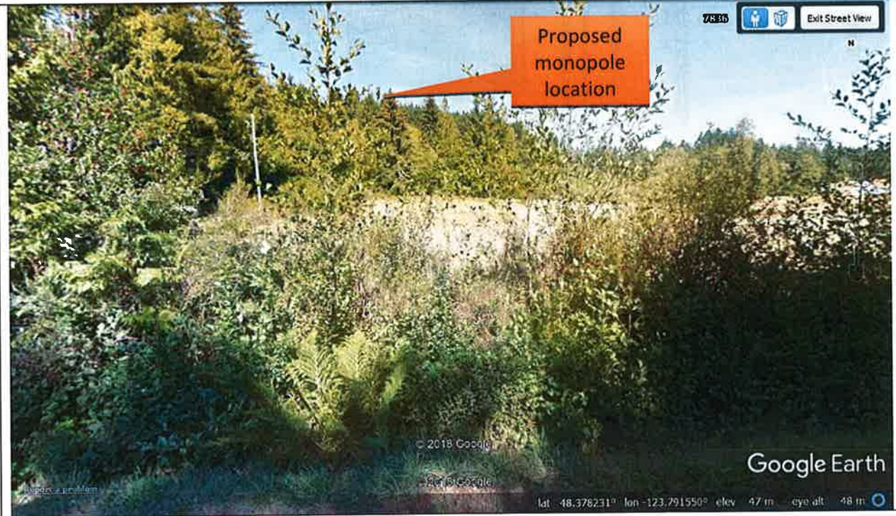
View: Looking west from Kemp Lake Road