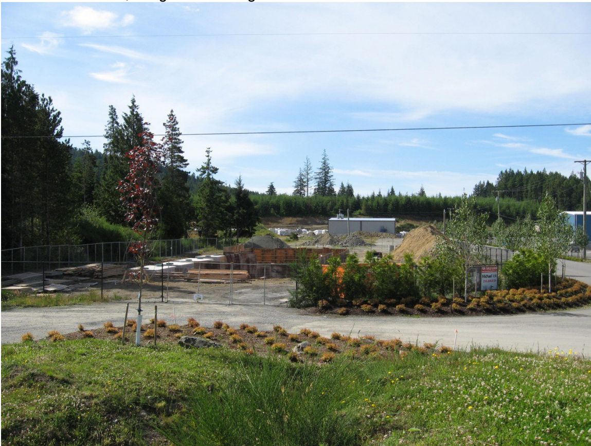
JdFEA Admin Services Building under construction, June 29, 2013. Four rainwater storage tanks installed to the left, and forming for the foundation underway.